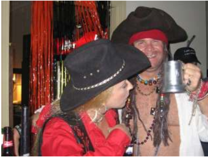
Yo ho ho & a bottle of Rum, Captain Morgan's Parrot Bay Rum that is!!!