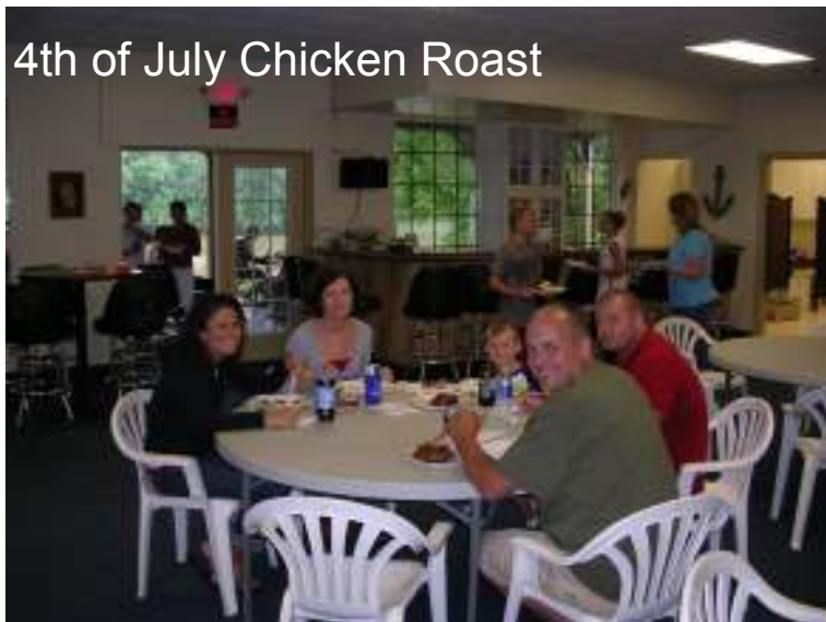
4th of July Chicken Roast