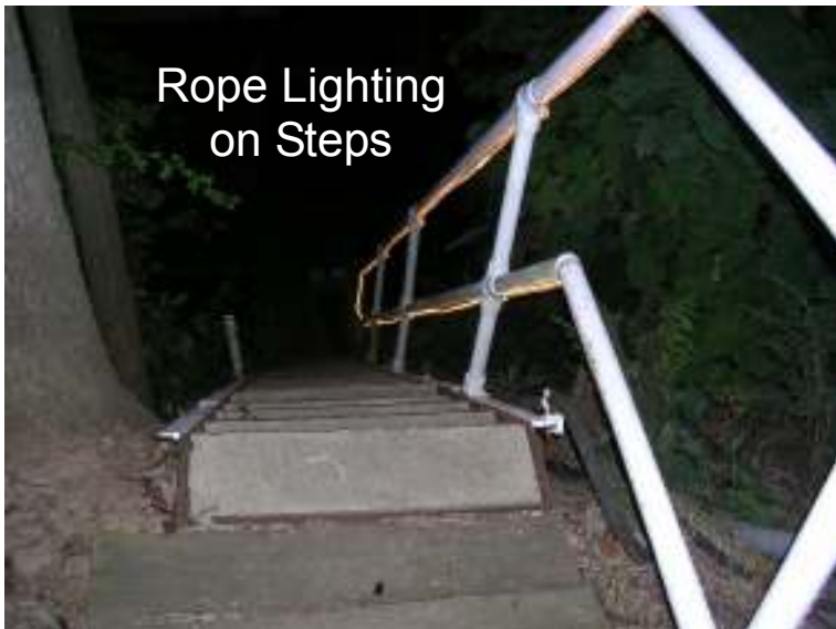
Rope Lighting on Steps