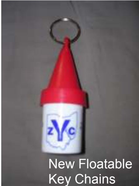
New Floatable Key Chains