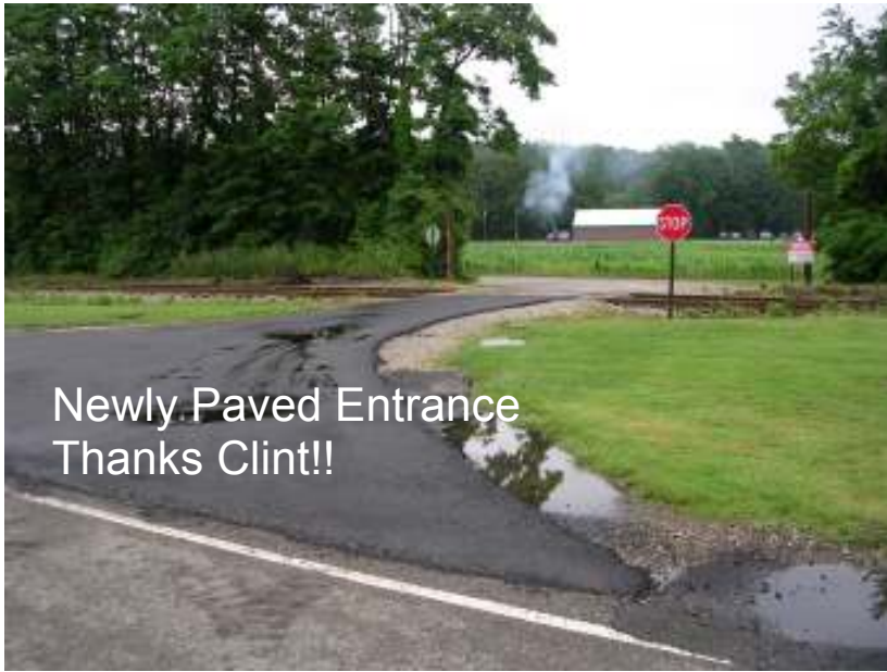
Newly Paved Entrance Thanks Clint!!