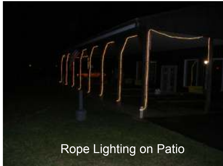
Rope Lighting on Patio