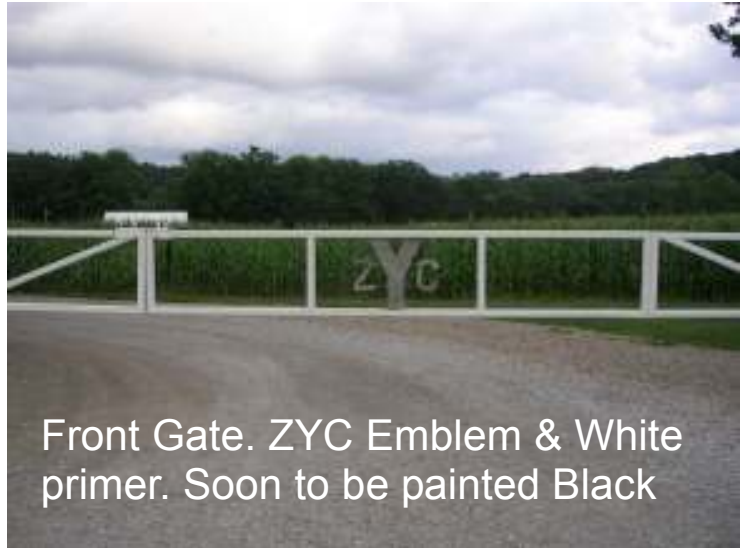
Front Gate. ZYC Emblem & White primer. Soon to be painted Black