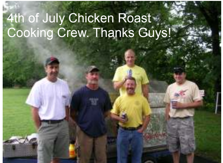
4th of July Chicken Roast Cooking Crew. Thanks Guys!