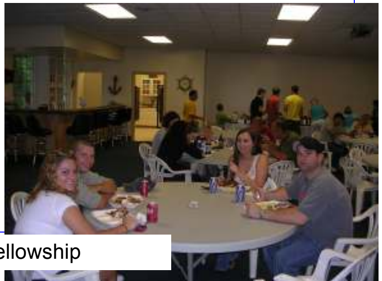
4th of July Chicken Roast Fellowship